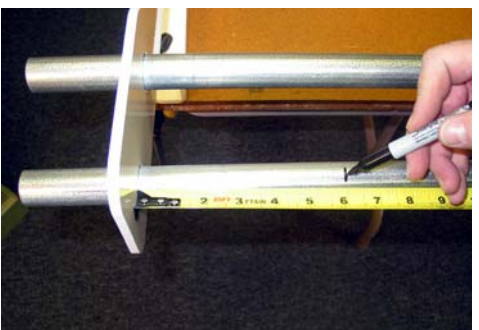
Next, prepare to attach the Velcro® to the tubes. Measure in 6" from each end of the frame.