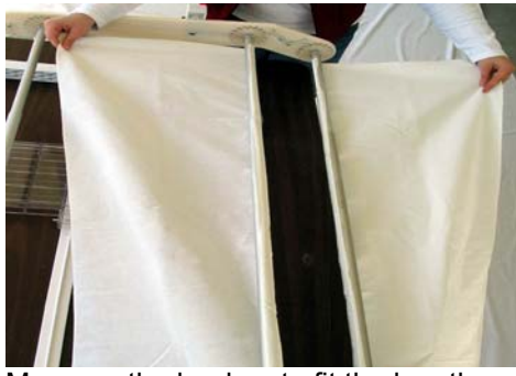
Measure the leaders to fit the length of Velcro® on the poles and cut to fit. If you don't wish to cut your leaders, custom cut leaders can be ordered from Handi Quilter Company.

Attach the leaders to the Velcro® on the first and second tubes so they hang to the center between the tubes.