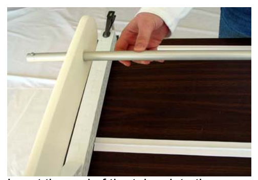
Insert the end of the tubes into the white side arm that does not have the Y latches. The tube with the foam grip is the single take-up roller.