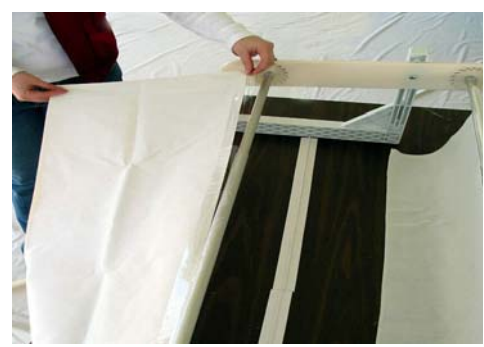
Attach the rear leader so it falls to the back of the rear tube.

Attach the leaders to the Velcro® on the first and second tubes so they hang to the center between the tubes.