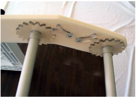
Slide the sprocket ends into the holes on the white side arm with Y latches. Hold the Y latches as you push in the tubes in so they don't get caught behind the sprocket. The latches and sprockets work together to hold tension on the quilt top and back.